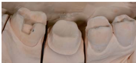
Picture 6: The cut gypsum model which resulted from the alginate impression of the clinical situation shown in picture 5: complex pieces of dental work such as crowns and inlays can be produced on the basis of such a model

In this context, we refer to the proven method of direct provisional treatment of prepared teeth with regard to crowns, partial crowns