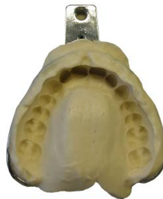
Picture 2: Impression taken with Cavex ColorChange: the Fast-Set alginate features a detail reproduction of 25 µm and can be stored for up to nine days without loss of dimensional stability, provided the processing guidelines of the manufacturer are met.

The consistency of a correctly blended alginate mass – in terms of powder to water ratio – may, dependent upon the product and the application purpose of the impression, range from medium viscous to heavily putty-like. But, from a practical point of view, it is essential to realise that not just