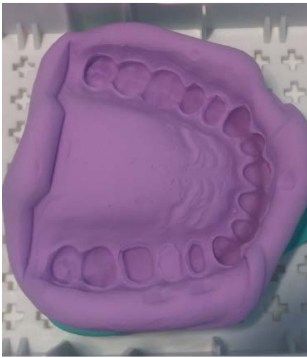
Picture 3: All Cavex alginate products can be disinfected simply and without loss of quality with ImpreSafe, a product specially developed for these alginates.

positive impression material for patients and practitioners alike. Other positive properties such as patient-friendly fragrance or taste additives and a change of colour which indicates the product has been correctly blended have also become something of a clinical standard for alginates. On the basis of their chemical capacity and materially reliable surface structure, alginates can also be subjected to unrestricted scanning, and can therefore be incorporated without any problem into the production flow of CAD/CAM-based dental work.