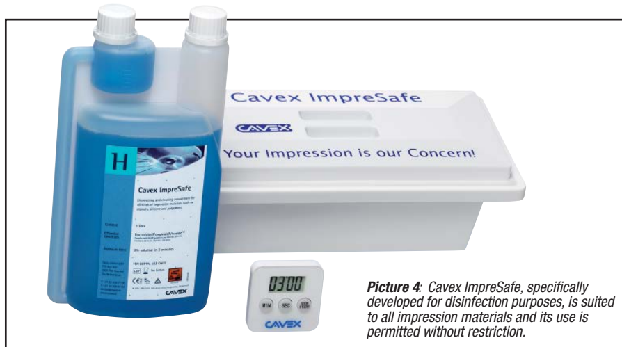
Picture 4: Cavex ImpreSafe, specifically developed for disinfection purposes, is suited to all impression materials and its use is permitted without restriction.

It is therefore not surprising that (according to research conducted by the author) about 15% of the relevant impressions taken in a northwest-German dental laboratory working for approximately 250 dental practices are analogue, i.e. traditionally/conventionally produced alginate impressions.