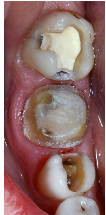
Picture 5: Clinical situation of a preparation which is not yet one of the traditional domains of alginate impressions, but which the newest generation of alginates bring within reach.

Accessories for the Cavex range of alginates include not only a practical mixing device (Cavex Alginate Mixer II) but also all the tools required for mixing by hand, as well as an easy-to-operate water measuring bottle and a disinfection bath developed