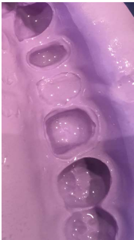
Picture 1: Detailed view of an impression taken with Cavex Cream Alginate. The excellent detail reproduction, approaching 5µm, is clearly visible.

Alginates – as a substance which can be mixed with water – have always been exceptionally popular thanks to their marked hydrophilic properties during the taking of impressions in the moist environment of the oral cavity. Their outstanding stability in the blended state is combined with their seamlessly connected reproduction of detail, both of complex intra-oral soft tissue structures and